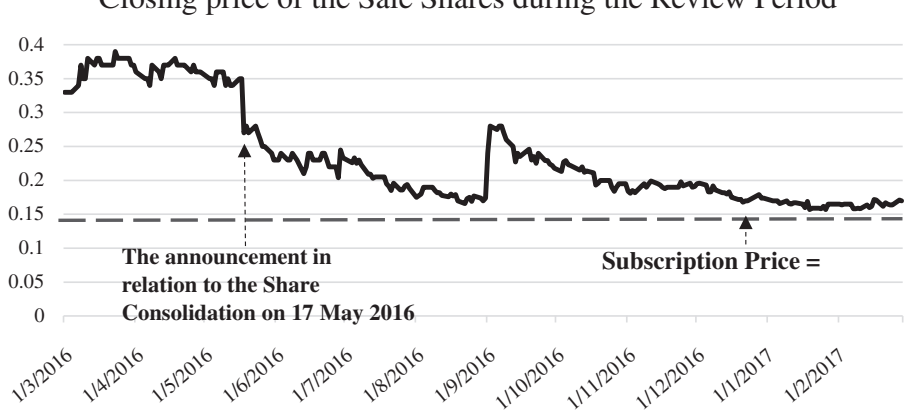
Closing price of the Sale Shares during the Review Period

Set out below is the movements in the daily adjusted closing price per Share based on the closing price per Share as quoted on the Stock Exchange for a 12-month period from 1 March 2016 up to and including the Last Trading Day (the " Review Period "):